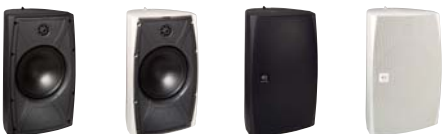
Black White Black Grille White Grille

Tweeter: 1" (25mm) Cloth dome, magnetically-shielded Woofers: Two 5-1/4" (133mm) Magnetically-shielded black Polypropylene cones with rubber surrounds Frequency Response: 55Hz – 20kHz ±3dB Impedance: 8 ohms nominal; 4 ohms minimum Power Handling: 5 watts minimum; 100 watts maximum Sensitivity: 90dB SPL (2.83V/1 meter) / Grille Material: Perforated aluminum Dimensions (H x W x D): 7-1/2" x 21" x 7-1/4" (191mm x 533mm x 184mm)