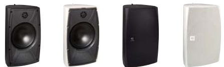
Black White Black Grille White Grille

Tweeter: 3/4" (25mm) Polyurethane dome Woofers: 5-1/4" (133mm) One-piece black Polypropylene cone with a rubber surround Frequency Response: 70Hz – 20kHz ±3dB Impedance: 8 ohms nominal; 6 ohms minimum Power Handling: 5 watts minimum; 60 watts maximum Sensitivity: 87dB SPL (2.83V/1 meter) / Grille Material: Perforated aluminum Dimensions (H x W x D): 10-1/4" x 6-1/2" x 6" (260mm x 165mm x 153mm)