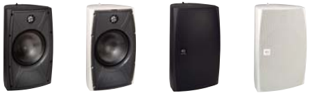
Black White Black Grille White Grille

Tweeter: Two 1" (25mm) Polyurethane domes Woofers: 5-1/4" (133mm) One-piece black Polypropylene cone with a rubber surround, dual voice coil Frequency Response: 65Hz – 20kHz ±3dB Impedance: 8 ohms nominal; 6 ohms minimum Power Handling: 5 watts minimum; 70 watts maximum Sensitivity: 88dB SPL (2.83V/1 meter) / Grille Material: Perforated aluminum Dimensions (H x W x D): 10-1/4" x 6-1/2" x 6" (260mm x 165mm x 153mm)