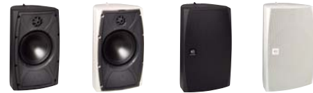
Black White Black Grille White Grille

Tweeter: Two 1" (25mm) Polyurethane domes Woofers: 6-1/2" (165mm) One-piece black Polypropylene cone with a rubber surround, dual voice coil Frequency Response: 55Hz – 20kHz ±3dB Impedance: 8 ohms nominal; 6 ohms minimum Power Handling: 5 watts minimum; 80 watts maximum Sensitivity: 89dB SPL (2.83V/1 meter) / Grille Material: Perforated aluminum Dimensions (H x W x D): 12" x 7-1/2" x 7-1/8" (305mm x 191mm x 181mm)