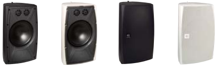
Black White Black Grille White Grille

Tweeter: 1" (25mm) Polyurethane dome Woofers: 5-1/4" (133mm) One-piece black Polypropylene cone with a rubber surround Frequency Response: 65Hz – 20kHz ±3dB Impedance: 8 ohms nominal; 6 ohms minimum Power Handling: 5 watts minimum; 70 watts maximum Sensitivity: 88dB SPL (2.83V/1 meter) / Grille Material: Perforated aluminum Dimensions (H x W x D): 10-1/4" x 6-1/2" x 6" (260mm x 165mm x 153mm)