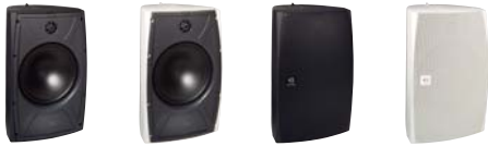
Black White Black Grille White Grille

Superb-quality audio transcends boundaries—and the Mariner line of speakers is the vehicle of choice for transporting that sound flawlessly to the great outdoors. In fact, we've created eight different speaker models—including those that offer full stereo sound in a single unit—to suit just about any application.