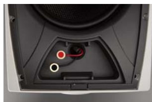
A protective channel safeguards wires all the way to the front panel speaker terminals. After connection, a snug-fitting cover further protects against moisture and the elements.