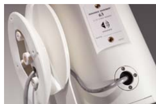
A wire entry grommet helps protect connections from the weather and acts like an extra hand, holding the speaker wire in place during installation and mounting.

Another Sonance innovation, Protected Access Connection Terminal (PACT), helps keep connections dry and safe from harsh weather conditions while simplifying installation.