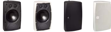
Black White Black Grille White Grille

Tweeter: 1" (25mm) Polyurethane dome Woofers: 8" (203mm) One-piece black Polypropylene cone with a rubber surround Frequency Response: 45Hz – 20kHz ±3dB Impedance: 6 ohms nominal; 4 ohms minimum Power Handling: 5 watts minimum; 125 watts maximum Sensitivity: 91dB SPL (2.83V/1 meter) / Grille Material: Perforated aluminum Dimensions (H x W x D): 14" x 9" x 9-1/4" (356mm x 229mm x 235mm)